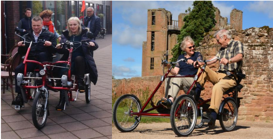
I'll have what she's having!