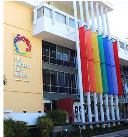
LGBT Center, Los Angeles