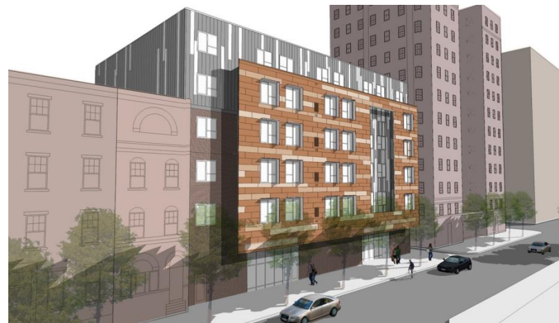
The Anderson Apartments, Philadelphia