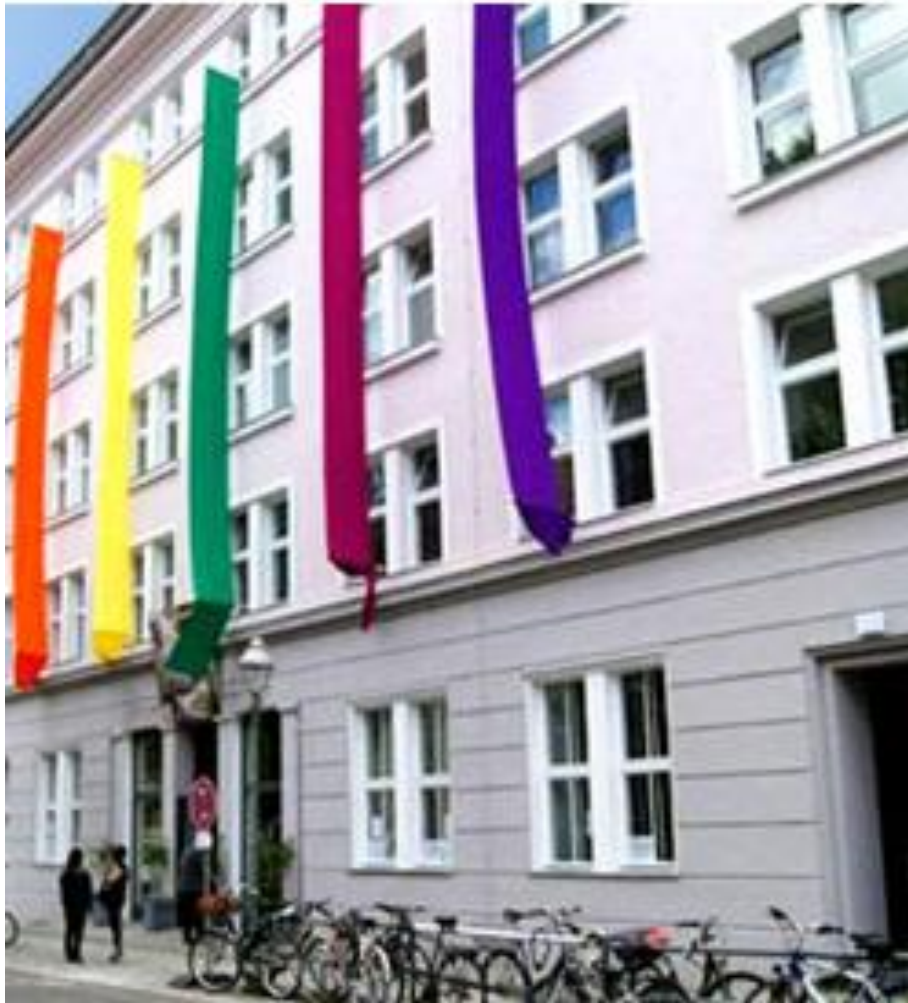
Lebensort Vielfalt, Berlin